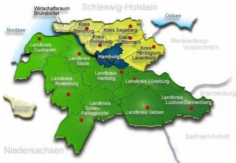
Chart: 'Metropolregion Hamburg'

Elmshorn is a city within the Pinneberg county (north-west of Hamburg), which is the smallest by surface size (664sqkm) but is home to 10% of the Schleswig-Holstein population with 300,000 inhabitants. The county is growing, not only for its proximity to Hamburg, but also due to its own industrial and agricultural companies. These contribute 11.6% of the state's GDP. Pinneberg county is part of the 'Metropolregion Hamburg'. Itzehoe is located in the adjacent Steinburg county and is the county's capital.