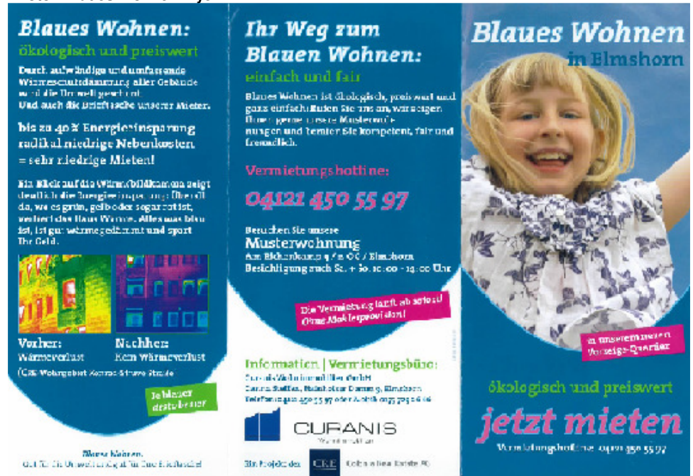
Photo: 'Blaues Wohnen' flyer

Blaues Wohnen stands for 'ecological living' and is adopted from the fact that infra-red heat detecting cameras produce the colour blue for cold areas, red and green for hot areas. The right part of the flyer explains the effect of the insulation efforts: while previously ('Vorher') the façade and the windows did not contain the heat inside the building, the situation improved significantly thereafter ('Nachher'). The flyer suggests that heating costs and side costs would decline by up to 40% from previous levels.