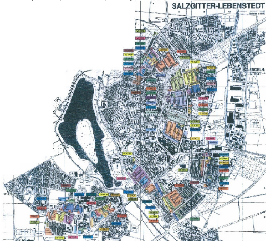
Chart: CRE's portfolio (coloured areas) in Salzgitter

CRE's portfolio is predominantly in Lebenstedt, which we see as the core city within the Salzgitter communities. Here CRE is the leading supplier of rental space. In Salzgitter, the city is similar to Berlin in a way that home ownership is low at around 14%.