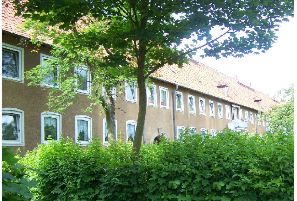
Photo: Lebenstedt assets

Particular giving the current economic situation, cheaper living space is of certain attraction. We understand from CRE that the current rent level of assets in Salzgitter fulfil the requirements of the social security in Germany and in Salzgitter. In other words: even if unemployment were to rise, the social security network would step in and pay the same rents as currently paid by the tenant, suggesting no rent losses on the current tenant structure.